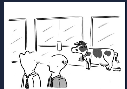
"Oh, that. We beefed up security."