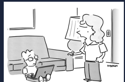
"Here's what you're going to do. You're going to give those 3 million people their credit card numbers back and you're going to say you're sorry."